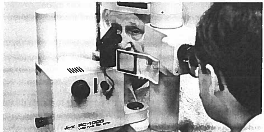
Laser Cell/Flare Meter

Now, the Laser Cell/Flare Meter opens a door to the mystery of the white blood cell buildup. Using a low-power, harmless laser beam directed (Continued on page 2)